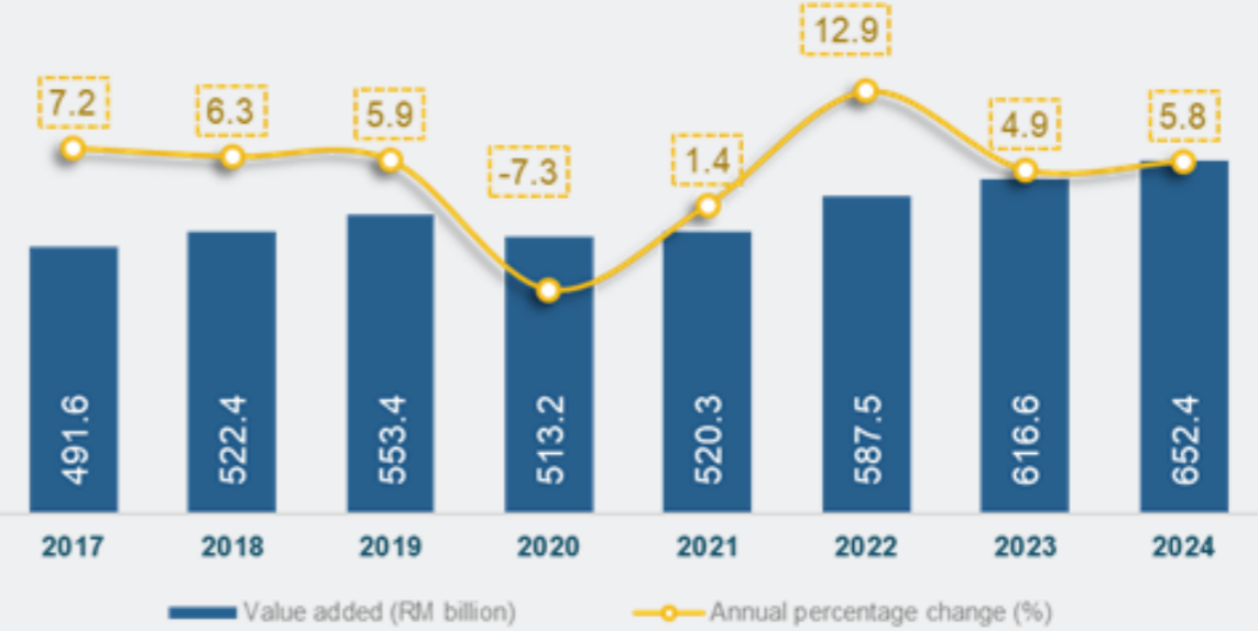
Value and Growth Rate of Malaysia's MSMEs' GDP at Constant 2015 Prices