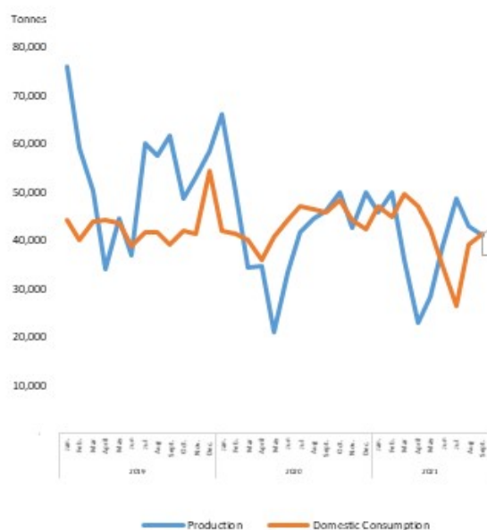
Chart 1: Monthly production and domestic consumption of natural rubber 2019 - September 2021 (tonnes)