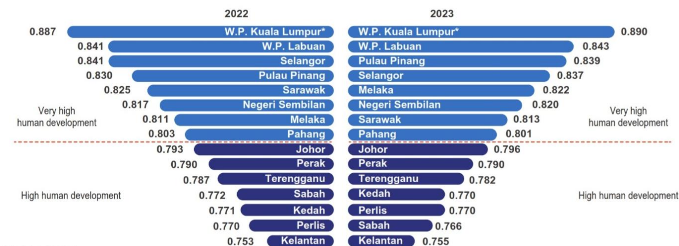
Chart 1: Malaysia Human Development Index by State, 2022 and 2023

Eight states were at a very high level of development in 2023. The state with the highest MHD score is W.P. Kuala Lumpur* with a score of 0.890, followed by W.P. Labuan (0.843), Penang (0.839), Selangor (0.837), Melaka (0.822), Negeri Sembilan (0.820), Sarawak (0.813), and Pahang (0.801). Meanwhile, the states that registered a high level of development were Johor (0.796), Perak (0.790), Terengganu (0.782), Kedah (0.770), Perlis (0.770), Sabah (0.766) and Kelantan (0.755).