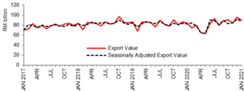
Chart 2: Export Value and Seasonally Adjusted Export Value, RM billion