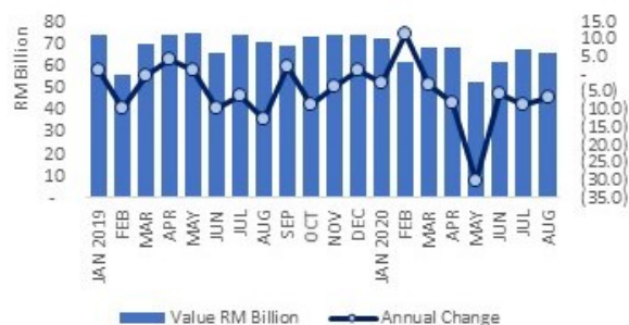
Chart 2: Imports, Value (RM Billion) and Annual Change (%)