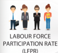
LABOUR FORCE PARTICIPATION RATE (LFPR)